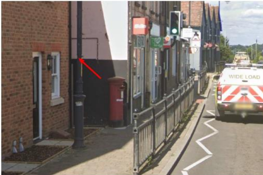
Figure 5 - Location of diffusion tube SW36 relative to facade of housing. Note the proximity of no. 6 Highstreet.