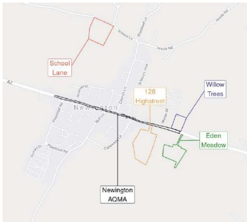
Figure 1 - Active non-trivial developments around Newington